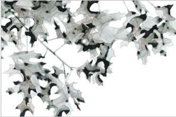
Ref: RX84078 Title: Fawn Shimmer