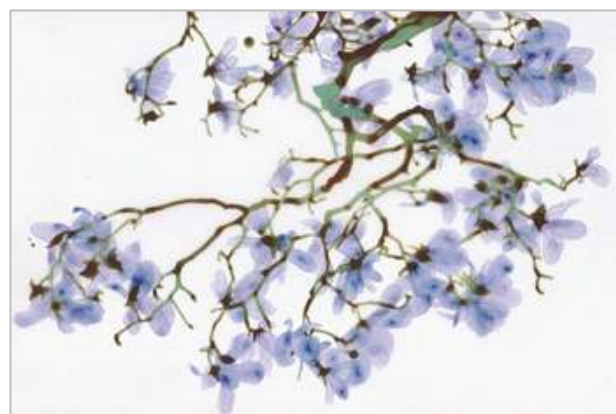
Ref: RX82722 Title: Pale Azure