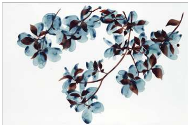
Ref: RX82725 Title: Dogwood