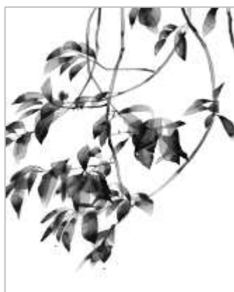
Ref: RH1679 Title: Pendent Noir