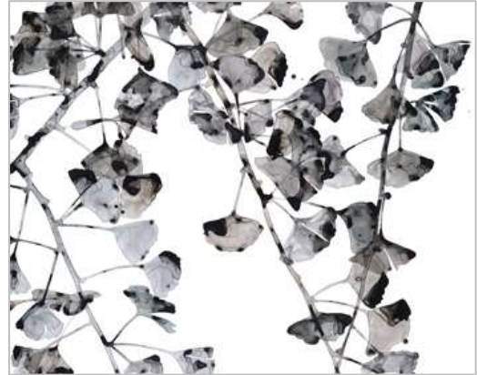
Ref: RH1868 Title: Ginkgo Noir