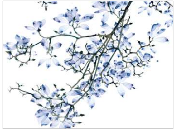
Ref: RT44055 Title: Pale Magnolia