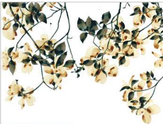
Ref: RT44056 Title: Golden Flourish