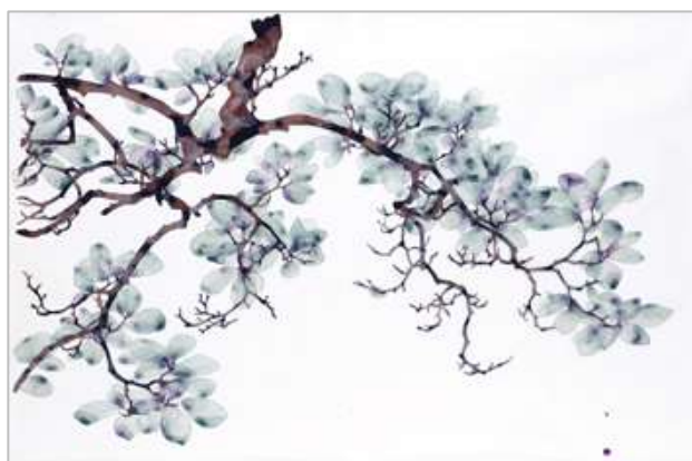
Ref: RX82723 Title: Magnolia