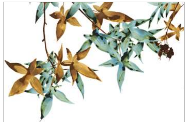
Ref: RX84077 Title: Green and Umber Leaves