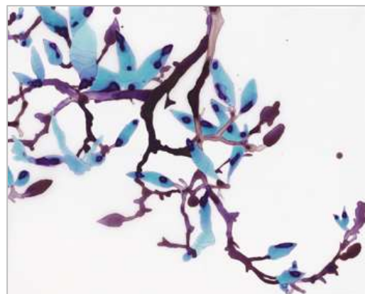
Ref: RH1052 Title: Teal Study