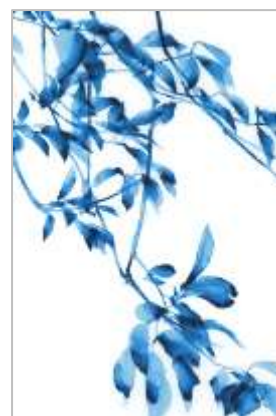
Ref: RX82438 Title: Pendent II